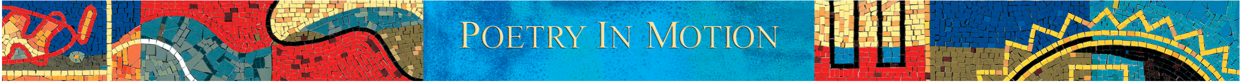
Mosaic artwork from 149th Street subway station by José Ortega for MTA Arts for Transit